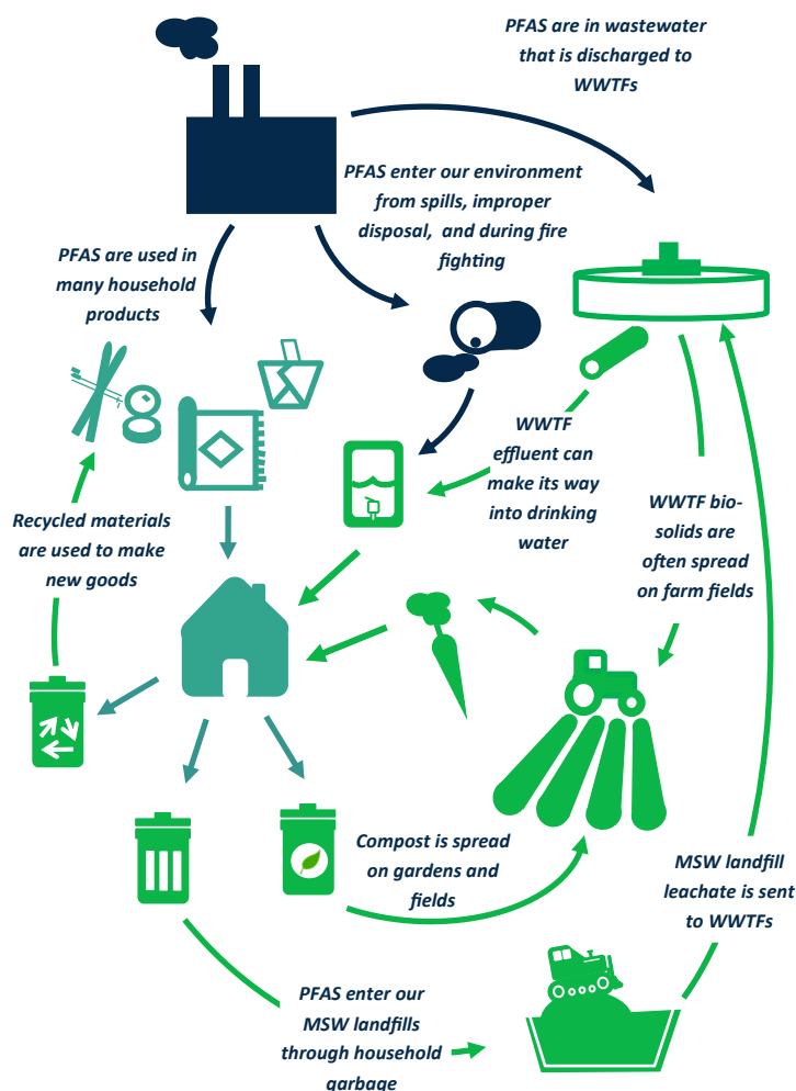
Figure 2: PFAS do not readily break down and when discarded, they flow through our waste systems and into the environment.